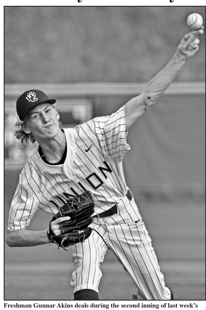
game vs. Dawson County.